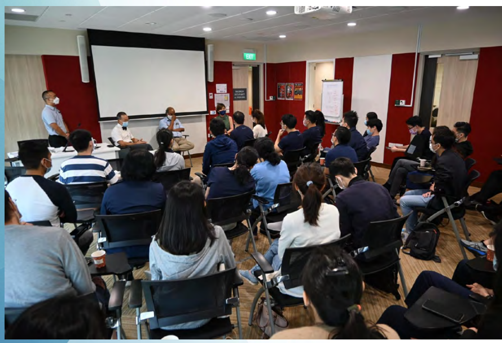
Guest speakers engaging in a Q&A session with the chief residents

She explained that the former imposes a label on the individual e.g. "I am a failure in life", and the latter acknowledges that something bad has happened, giving the individual opportunities to see it as a learning moment and think about possible solutions.