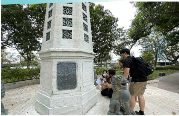
W@W National Day Amazing Race: Breathe, Meet and Re-Discover