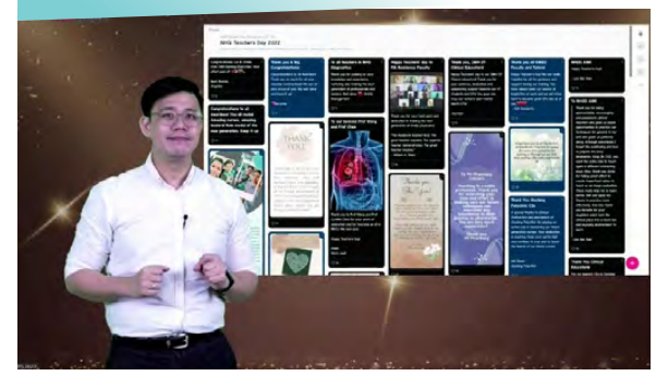
Shaping and Leading the Future: NHG Teachers' Day 2022