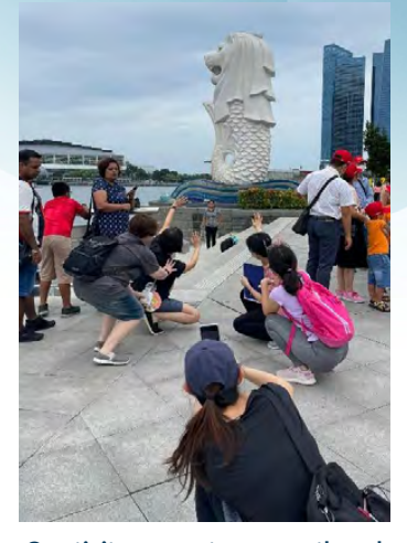
Creativity never stops even though the Merlion stopped sprouting water

Fun and games aside, many new staff expressed their appreciation for the opportunity to meet and interact with their colleagues face-to-face, for the very first time.