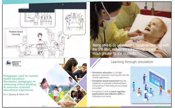
Inter-Professional Education Journal Club -Learning and Thriving Together